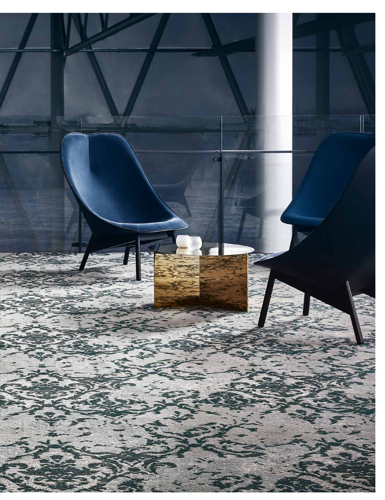
Colortec Accent 14769,5947 P