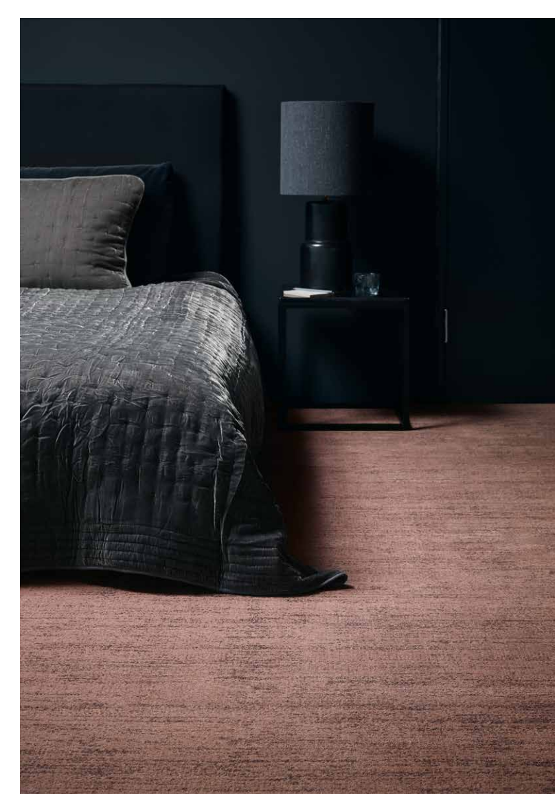
Colortec Accent 13859,5947 R